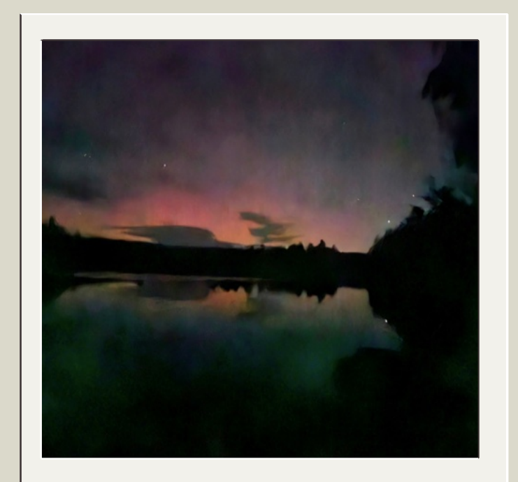
Northern Lights- Kam Osborne