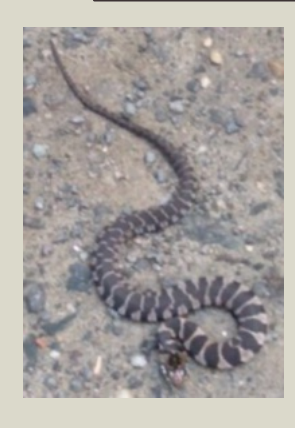
Finally, as promised in the last newsletter, this little guy is a Northern water snake.

This Month's Nature Challenge: When I stepped outside one evening to get a glimpse of the rising Harvest moon, I was serenaded by a lonely cricket chirping rhythmically nearby.